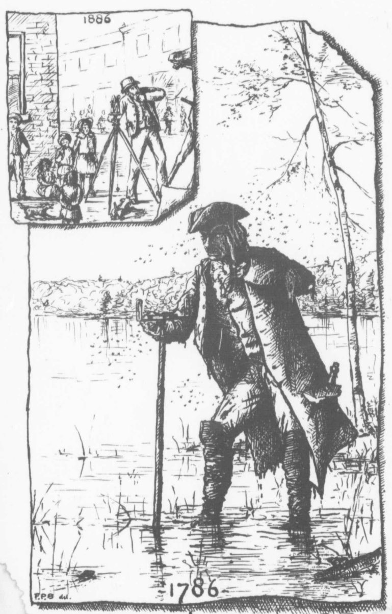
-" [ FEWHETPYS A YWVIOTYS"-