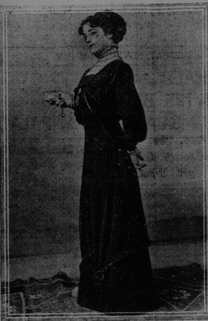
APRON DRESS OF WINE RED PERMO FABRIC Fifteen frocks of all sorts are immensely popular this winter, and the pinafore showing a bit extending up over the bodice is the favorite style.