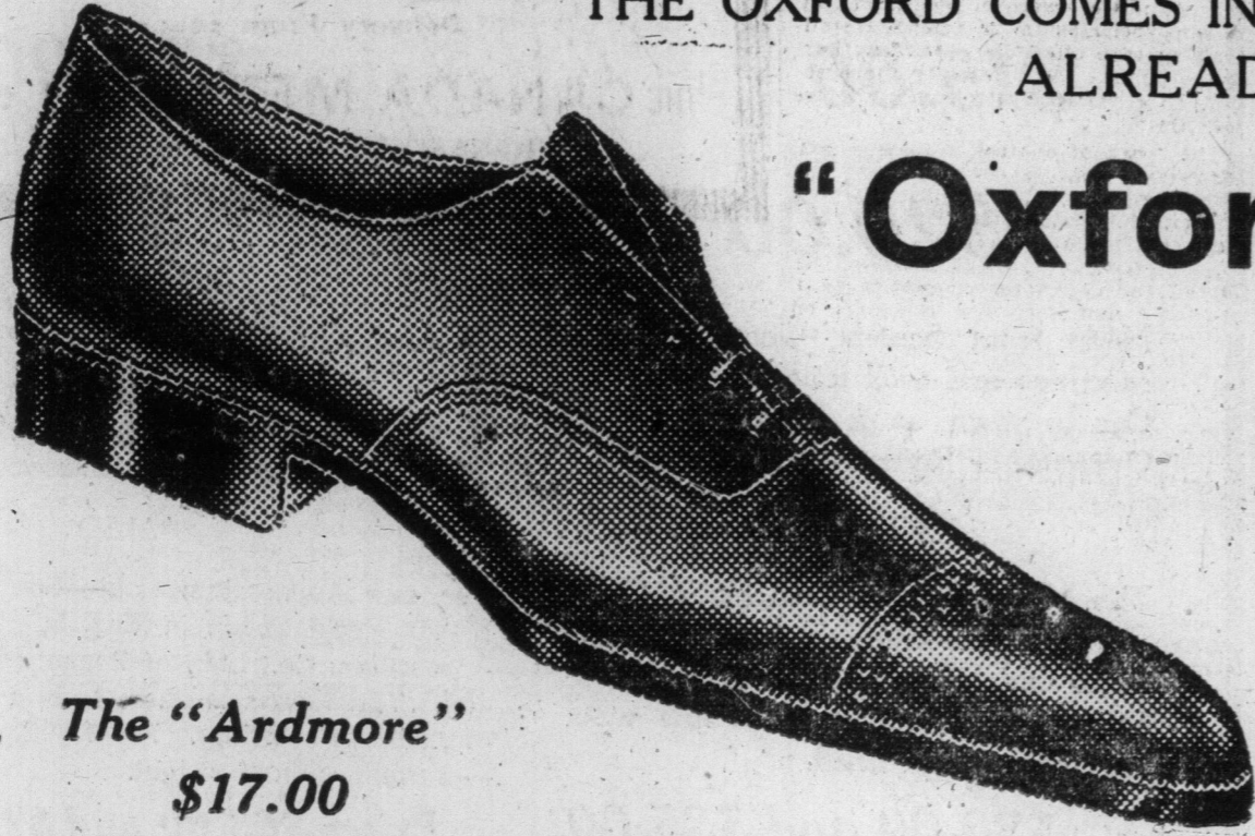
The "Ardmore" $17.00

THIS IS THE YEAR THE OXFORD COMES INTO ITS OWN ALREADY THE CRY IS