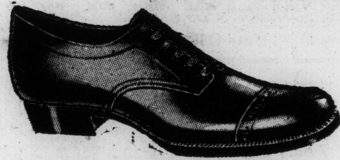
Is Priced at $14.00

It is of chocolate vici kid, in Blucher lace style, with Goodyear welted soles.