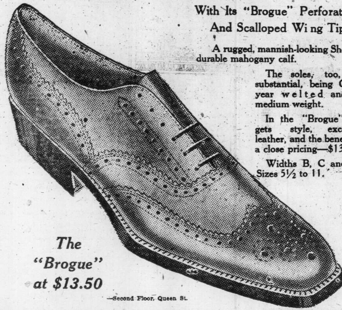
The "Brogue" at $13.50

A rugged, mannish-looking Shoe, of durable mahogany calf.