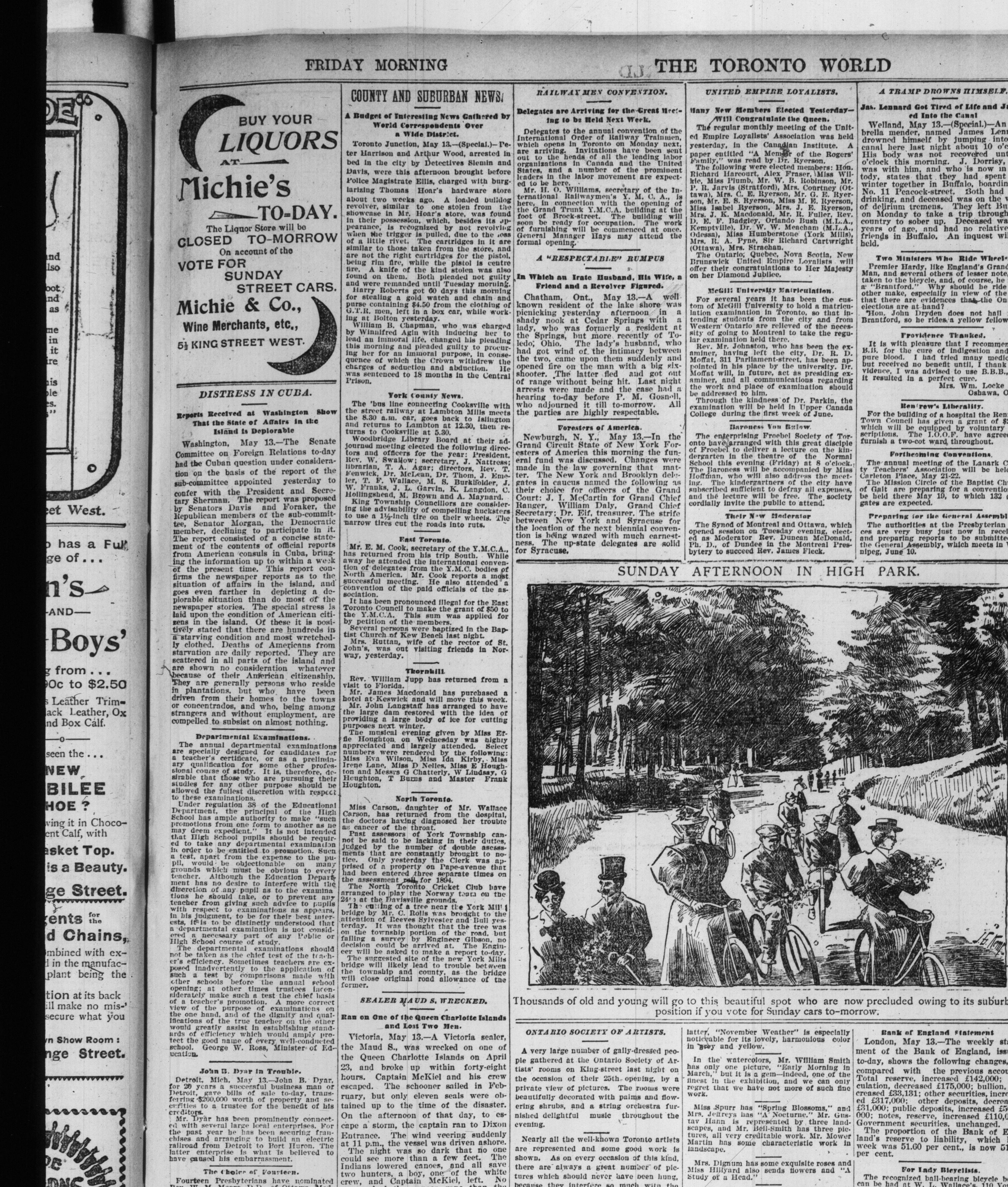
Thousands of old and young will go to this beautiful spot who are now precluded owing to its suburban

Preparing for the General Assembly. The authorities at the Presbyterian offices are very busy just now in receiving and preparing reports to be submitted to the General Assembly, which meets in Winning. June 10.