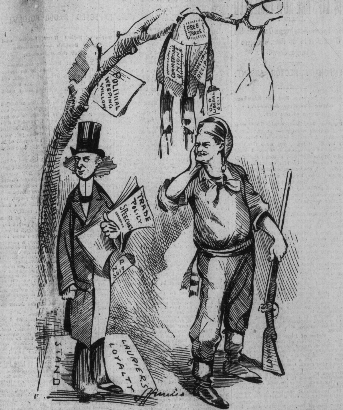
JACK CAUCUS: I sincerely approve of your loyalty stand, Wilfrid, but it would be as well to drop all that trade policy guff while you are wearing stolen clothes.