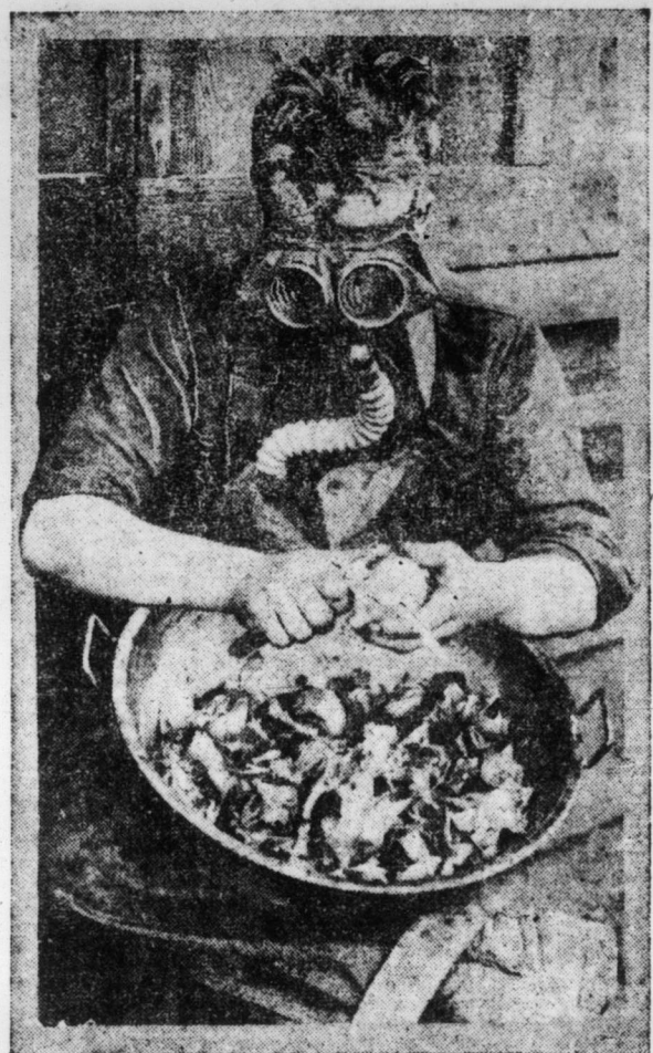
A New Use For the Gas Mask. An American soldier in camp "somewhere" who does not intend to weep while he's peeling onions.

Rome, June 23.—A semi-official note issued to-day says: "The enemy, obliged to hide the disastrous failure of his offensive, has had to resort to falsifications. Thus the Austrian official communication of June 22 announced the capture of 40,000 prisoners. The truth is that this figure represents the entire Italian losses in killed, wounded and missing."