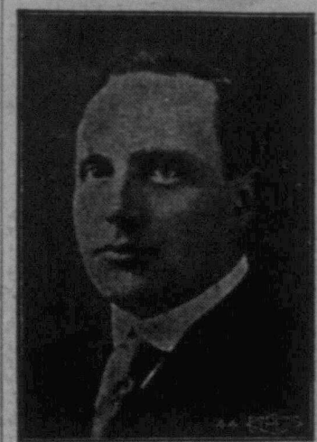
Who will represent North American Labor at the Paris conference

will be the whipping into shape of the industrial conditions bill passed at the ast session of the legislature. Labor last session of the legislature. Labor At the first regular meeting of the should in future be five cents instead of refused to recognize this bill at that Trades and Labor Council, for 1920 held seven. bring down this bill so that it will be