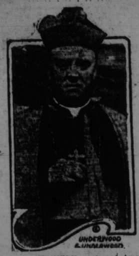
MR. BORDEN, PREMIER OF CANADA.

London, Sept. 21.—It is officially announced that the Earl of Liverpool has been appointed Governor and Commander-in-Chief of New Zealand.