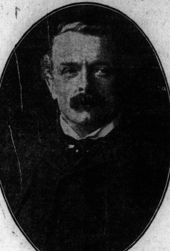
DAVID LLOYD GEORGE

The greatest moving picture in the world