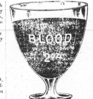
This represents the exact amount of Rich Red Blood added to your blood. Vessels by taking one Capsuloid each meal three times daily.

Take ONE or even TWO with each meal three times daily, if you are very bad, and stick to them until the rich, red blood which they make has made your stomach strong and well.