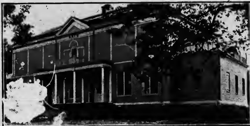
FINE ARTS BUILDING, NOVA SCOTIA PROVINCIAL EXHIBITION

with thanks Teller of your function can be held for Catalogue E 12