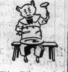
This little pig had roast beef.