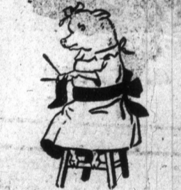
This little pig stayed at home.