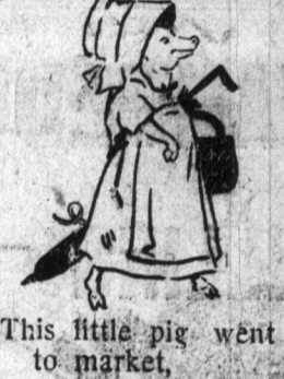
This little pig went to market.