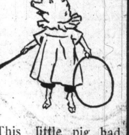
This little pig had none.