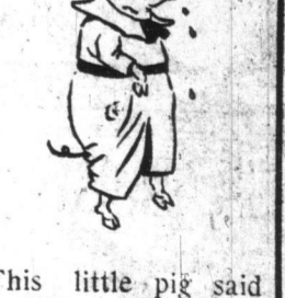
This little pig said "Wee wee" all the way home.