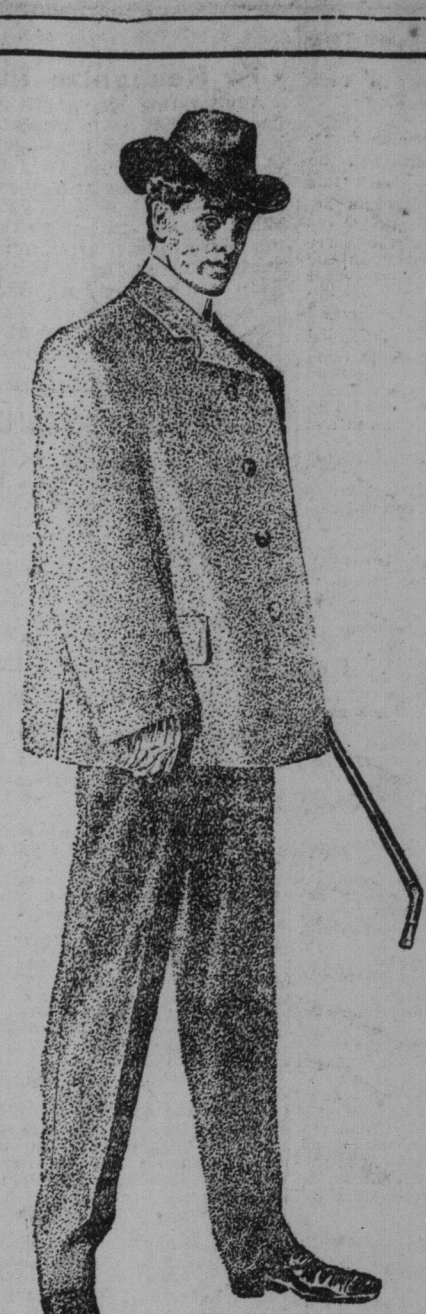
Styles for every occasion. Convert to Ankle length.

You will agree with me, I think, that water is a splendid drink—For those who are fond of it—And yet, unless I greatly err—There may be times, old chap, when you and I, would much prefer a "Club" Old Tom night cap.