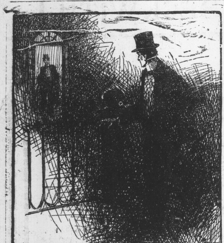
"A SQUARE OF LIGHT SUDDENLY OPENED IN THE NIGHT."

"As I felt my way along the wall, I encountered other men who were coming from the opposite direction, and each time when we hailed each other I stepped away from the wall to make room for them to pass. But the third time I did this, when I reached out my hand, the wall had disappeared, and the further I moved to find it the further I seemed to be sinking into space. I had the unpleasant conviction that at any moment I might step over a precipice. Since I had set out I had heard no traffic in the street, and now, although I listened some minutes, I could only distinguish the occasional footfalls of pedestrians. Several times I called aloud, and once a jocular gentleman answered me, but only to ask me where I thought he was, and then even he was swallowed up in the silence: Just above me I could make out a jet of gas which I guessed came from a street lamp, and I moved over to that, and, while I tried to recover my bearings, kept