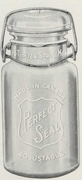
"BABY" (Reputed half pint)