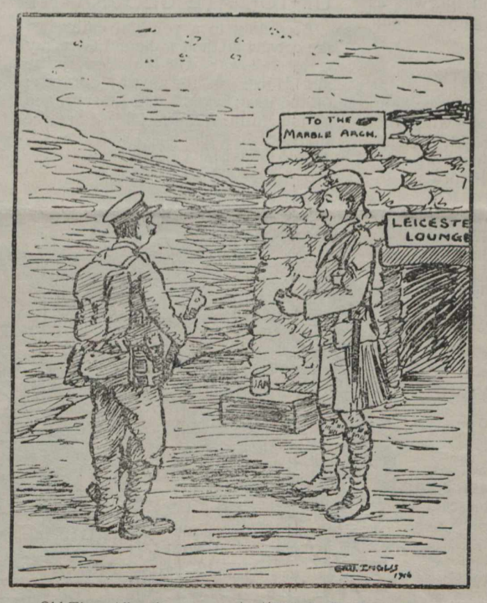
Old-Timer (directing new man): "H.Q.? Go down Oxford St. till you reach Suicide Corner and turn down Lover's Lane. H.Q. is the last dug-out in Rotten Row, and keep your head down in Lover's Lane or you'll be getting a hole in it."

whose daily shipments average over 1,000 cases. When the Canadians moved up to the front a year ago April, a convenient centre was selected and a larger stock installed. But the good work had hardly been launched when fortunes of war necessitated a temporary evacuation and the precious stock lost and the building subsequently shelled. However, notwithstanding this temporary set-back, the need was there and had to be supplied. One after another new centres were estab-