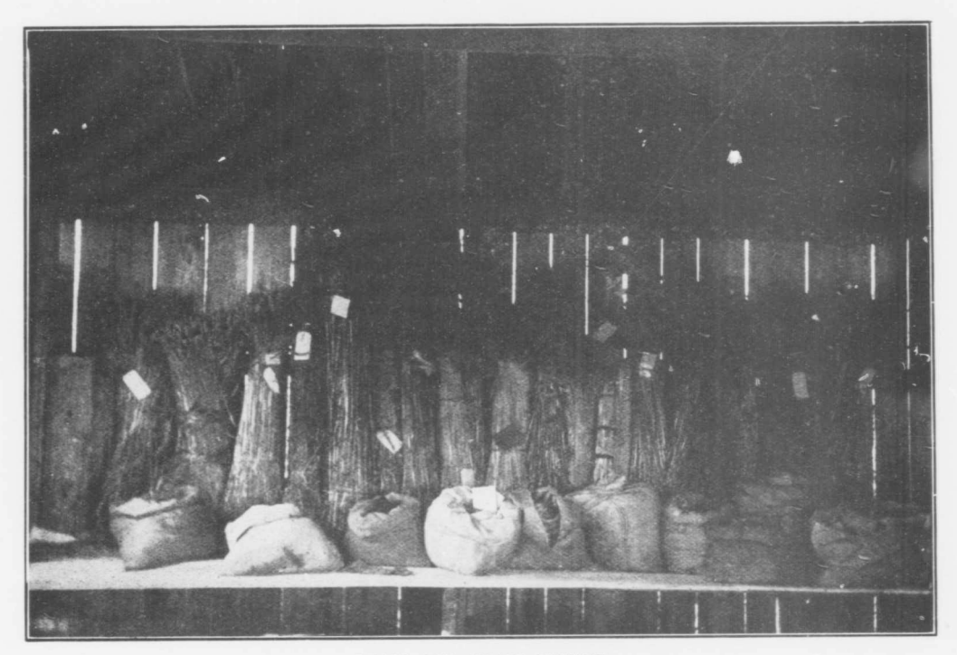
GRAIN AND GRASS EXHIBIT