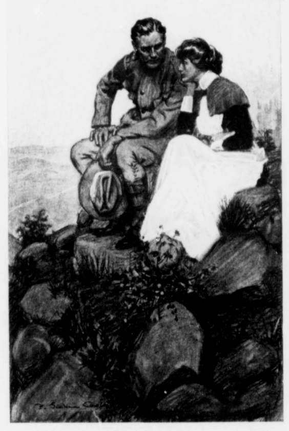
Never in the years that had gone had there been such selence between them