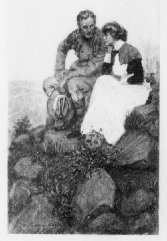
Never in the years that had your had there been such site me between them