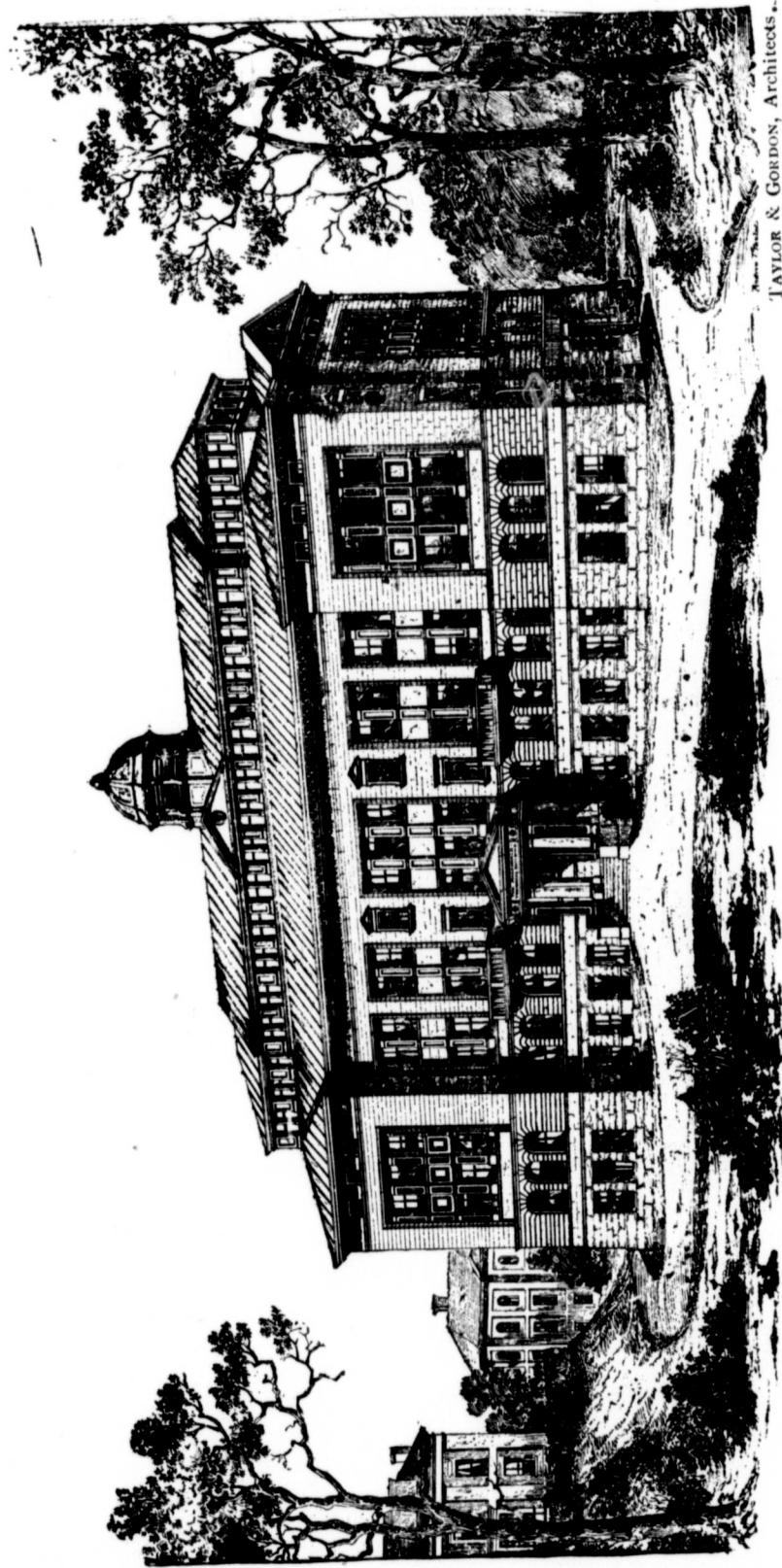
THE W. C. McDONALD ENGINEERING BUILDING.