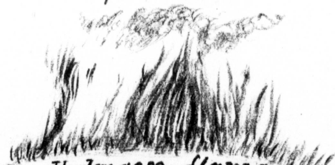
Hydrogen flame 1890 Aug 3. 7 2 50m