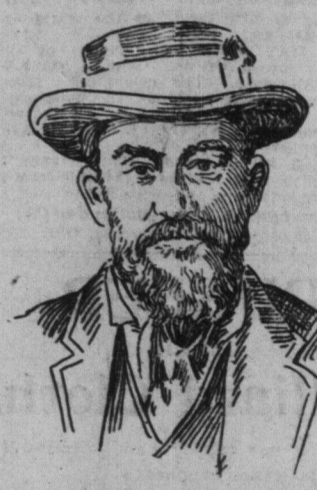
Who is Causing So Much Trouble to British Forces in Africa.

Baden-Powell's Headquarters in the Old Dynamite Factory... Modderfontein—Farewell Address of Lord Roberts—to be Laagered and Guarded at Johannesburg.