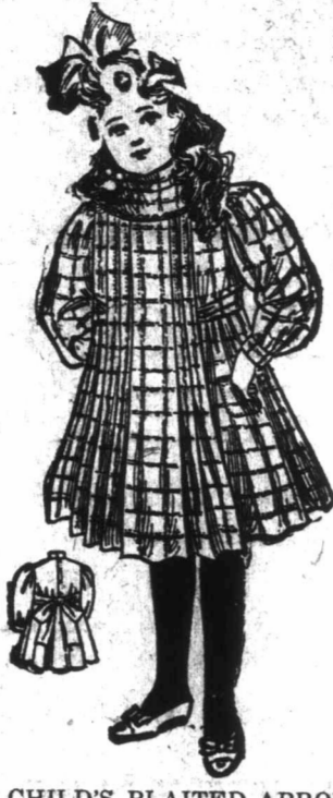
CHILD'S PLAID APRON