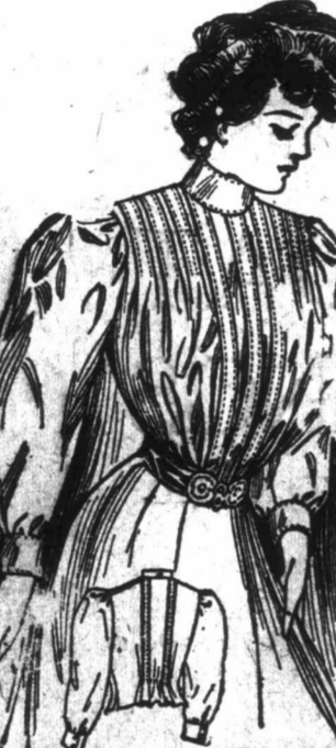
LADIES' SHIRT WAIST