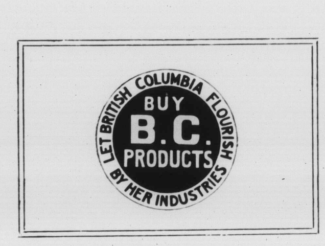
(B.C. M. Space Contribution)

(In our next issue we shall publish a review of the exhibits in detail.)