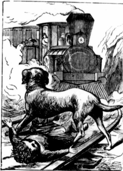
A NOBLE DOG.