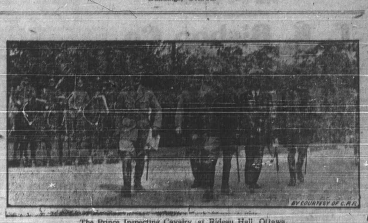
The Prince inspecting Cavalry at Rideau Hall, Ottawa.