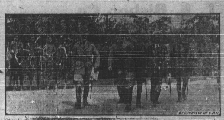
The Prince Inspecting Cavalry at Rideau Hall, Ottawa.