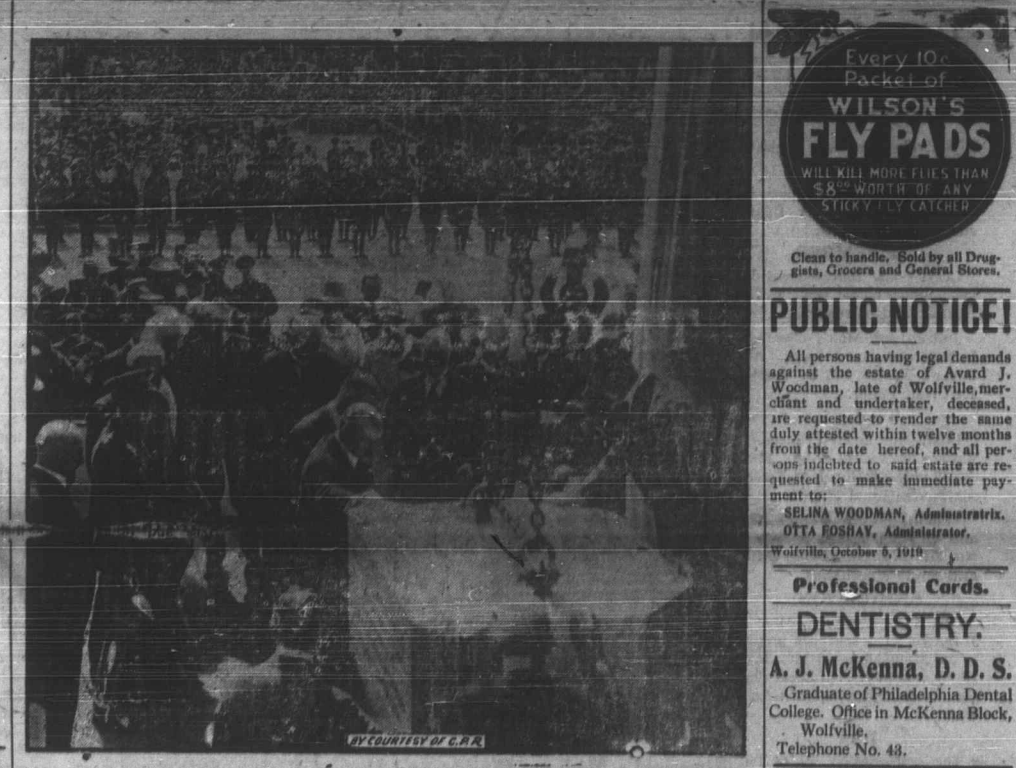
orner-stone for the central tower of the Parliment Buildings, Ottawa. Prince of Wales laying the