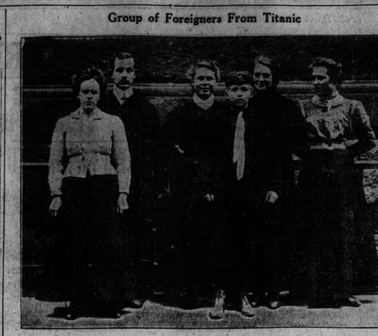
A group of Swedish survivors of the Titanic, taken at the Swedish Mission, New York. Each one in the picture was in the straggle and was bereaved of all relatives on board the disaster. The boy in the center lost both parents, a brother and a sister.

St. James' Cathedral for many years has been the scene of annual patriotic services, but that of the St. George's Society last night will be historic for its memorable contrasts.