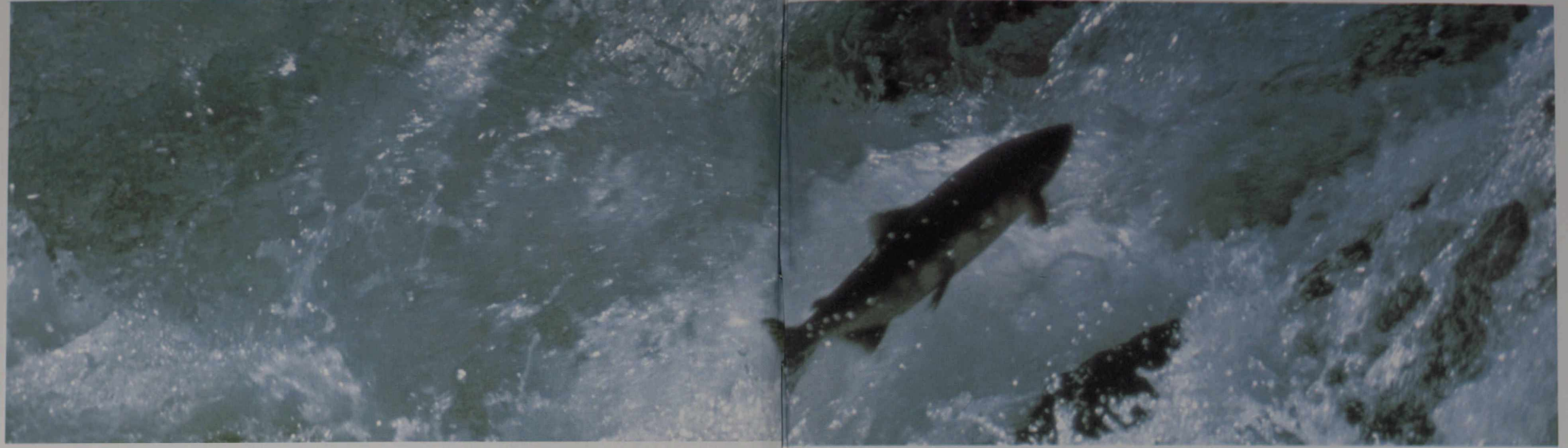
The powerful spawning urge sends this pink salmon leaping up a waterfall in Alaska.