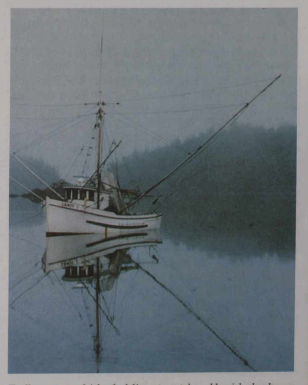
Trollers use multi-hooked lines to catch unblemished salmon, which are sold whole to gournet markets.

It is possible to regulate the netting of particular salmon off the mouths of particular river systems with relative ease because their arrival dates are known and their numbers can be predicted. Pacific salmon arrive in the mouths of the rivers two to five years after they are born, swim upstream, spawn and die. The salmon of any river can be identified by their scales — not only can those from the Fraser system be distinguished from the Columbia River