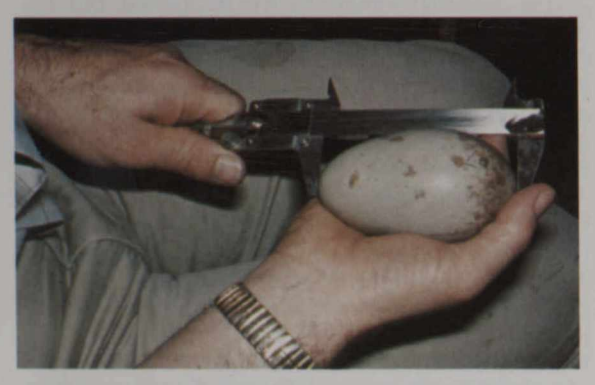
Whoopers' eggs are speckled with shades of green and brown. The better-formed egg is left undisturbed; the lesser one taken.

There are now an estimated 106 whoopers, free or captive, in North America. Whoopers are long-lived (Crip at the New Orleans Zoo lived to be 35 years old), and they do not mate until they are at least three. This spring it is possible, though unlikely, that the first whoopers hatched by sandhill cranes could find each other, mate and produce one or more whoopers of their own.