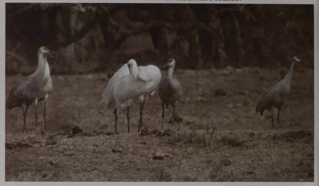
The bright white cranes are whoopers; the others are sandhills.

one egg is smaller or somewhat misshapen, it is chosen and the more promising egg left in the nest. Both eggs from non-reproductive parents are also taken, and one is replaced with an egg from a more successful pair. Each chosen egg is slipped carefully into a thick wool sock and returned to the helicopter where it is transferred to an incubator suitcase heated with hot water bottles. The helicopter flies on to the next nest until the operation is completed. (One year one nest was found with three eggs and two were removed.)