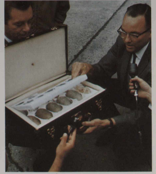
Eggs travel nest to nest in a special incubator and are bathed in oxygen along the way.