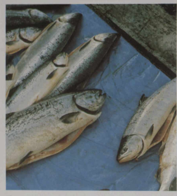
These salmon, cleaned and gutted, were taken by trollers. They are being processed on the Queen Charlotte Islands.