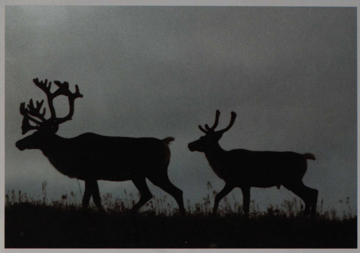
The caribou is the great survivor migrating to the coldest part of North America and taking sustenance from the barren ground. During this century its numbers have declined, and the US and Canadian governments are now engaged in concerted programs to protect its birthing grounds and migration routes from damaging developments.