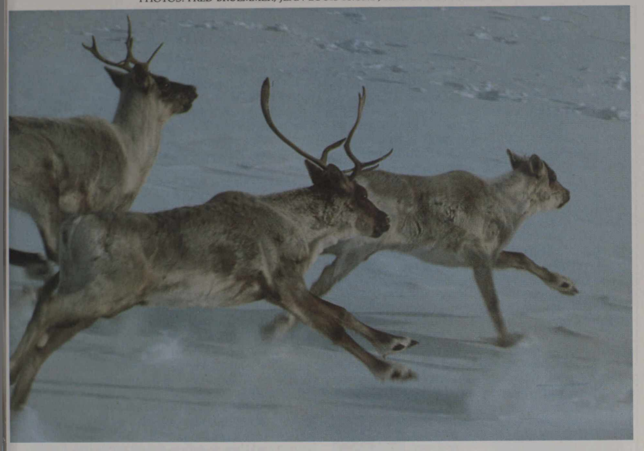
Caribou can outrun wolves. Within days after birth, young caribou can keep pace with the herd.

Commission of Inquiry conducted hearings on pipeline construction and concluded, among other things, that it posed a serious threat to caribou in the Mackenzie Valley of the Northwest Territories.