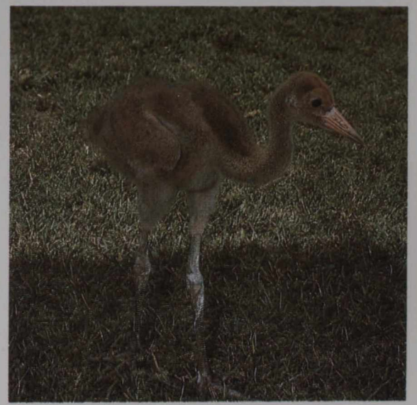
Nesting cranes usually produce two eggs but only one baby, a fact that underlies the joint US-Canada survival program.

At Idaho Falls, Idaho, a US customs official gave the eggs quick entry and the scientists climbed into a small helicopter with the incubating suitcases on their laps. Thirty-five minutes later they landed on a large island in Grays Lake, transferred to shallow-draft air boats and head for the nests. One sandhill egg had been removed from each selected nest before the day the whooper eggs arrived. The second was exchanged for a single whooper egg. An aerial survey the next day showed the nesting sandhills back on the job. Three eggs proved infertile and two were lost to predators. Nine hatched. One of the chicks was killed in a June snowstorm and two disappeared in July. The remaining six survived and five were colour banded. Seven months after hatching at least five had made it to the sandhills' winter quarters near the Bosque del Apache National Wildlife Refuge in New Mexico. The whoopers, larger than the sandhills, have no trouble defending themselves among other cranes. Two winters ago one