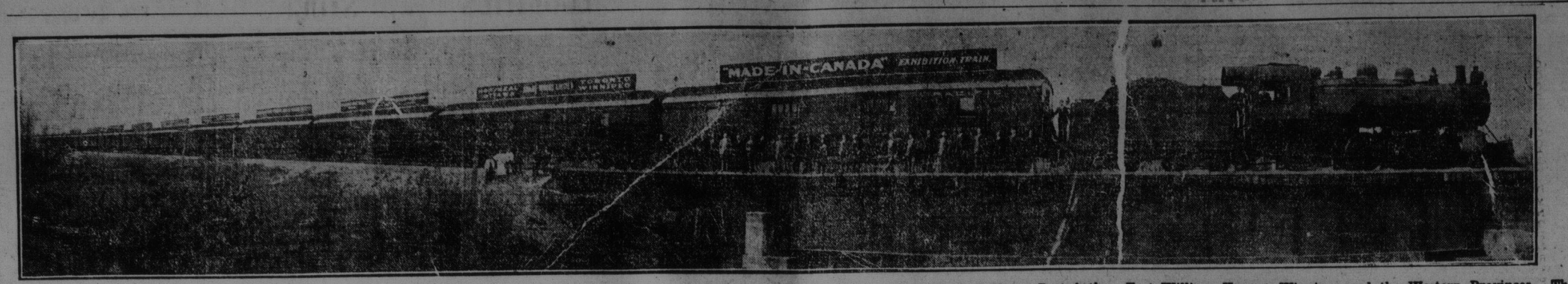
This illustration of the Made-in-Canada Exhibition Train was taken near Byng Inlet the day after the special left Toronto on its way to Sudbury, Port Arthur, Fort William, Kenora, Winnipeg and the Western Provinces. The signs along the top of the train indicated the Exhibits in the various cars. The special consisted of engine, eleven cars of exhibits, a dining car and two sleepers.