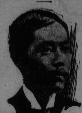
YUKIO OZAKI, Lord Mayor of Tokyo.

Yukio Osaki Is Born Reformer And Compared To Mayor Gaynor-Expected To Call On President Taft.