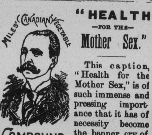
Miles' (Can.) Vegetable Compound

HEALTH FOR THE MOTHER SEX. This caption, "Health for the Mother Sex," is of such immense and pressing importance that it has of necessity become the banner cry of the age. Women who have been prostrated for long years with Pro-lapsus Uteri, and illnesses following in its train, need no longer stop in the ranks of the suffering. Miles' (Can.) Vegetable Compound does not perform a useless surgical operation, but it does a far more reasonable service. It strengthens the muscles of the Uterus, and thus lifts that organ into its proper and original position, and by relieving the strain causes the pain Women who live in constant dread of PAIN, recurring at REGULAR PERIODS, may be enabled to pass that stage without a single unpleasant sensation. Four tablespoonfuls of Miles' (Can.) Vegetable Compound taken per day for (3) three days before the period will render the utmost ease and comfort. For sale by all druggists. Prepared by the A. M. C. MEDICINE CO., 136 St. Lawrence Main St., Montreal.