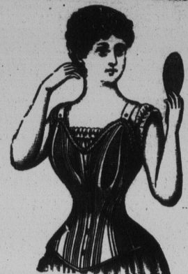
MADAME WARREN'S Dress form Corset.

THIS CORSET, in addition to its other merits, is provided with a long high bust, and so shaped as to produce a perfect "Dress Form" body, fitting up any hollow part of the chest, and giving it the appearance of a natural and easy way to the bust. It is made of the finest material, and is so constructed that it will support the bust of ladies of the best figure, and will improve the shape of the bust and the fit of the dress in every instance, no matter how good the natural figure. For sale by CHAS. K. CAMERON & Co. 77 King St.