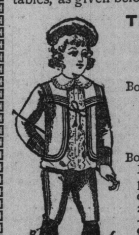
TABLE 1-Boys' Odd Coats in blue and I brown Serge, Italian cloth linings, a garment in constant demand, sizes 22 to 26. Regular $1.50-Special price 99c. Boys' Navy Blue Sailor Blouse Suits, with

For convenience and to insure no confusion that we may give perfect attention to your wants, the advertised lines have been divided and placed on three separate tables, as given below: