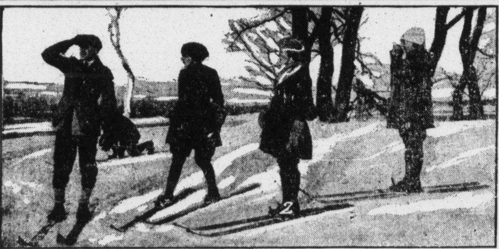
(1) Taking the Ski Jump opposite the Chateau Frontenac, Quebec, (2) Ready for a hike