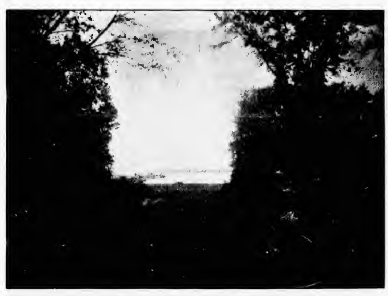
VIEW OF THE OTTAWA FROM THE TOMB.

ı Canada, rousie, the was called hole eivil taking to two years : accounts iture over l that the uself and voted en ng the life ition Papd, holding voted in diture ac-