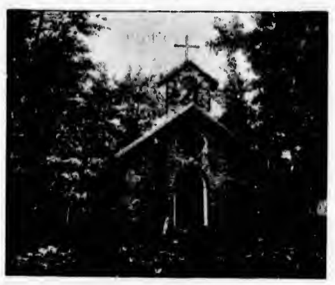
THE TOMB OF THE PAPINEAUS, (Mausoleum in the Park.)

treasury. It was that resolution that Canadians owe the liberties they enjoy precipitated the insurrection, though to-day. The attempt of American which deprived the assembly of con-though residing in the United States