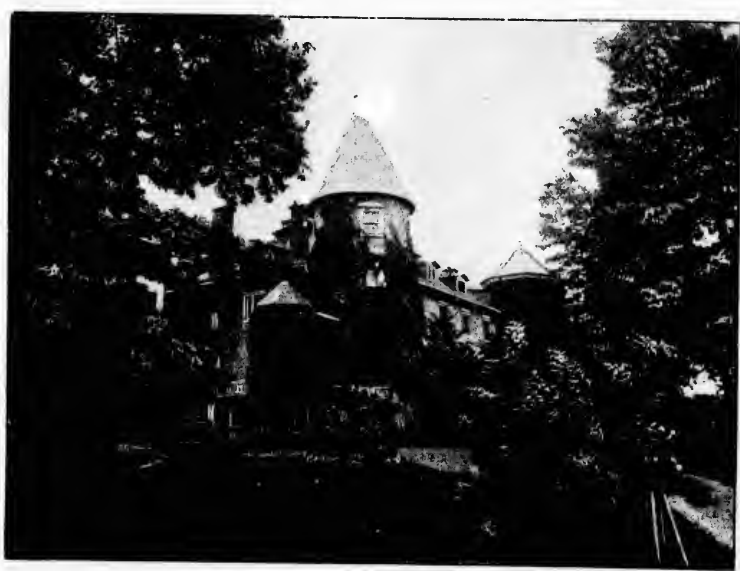
THE CHATEAU FROM THE RIVER BANK.

his chateau at Monte Bello. still took a lively interest in the affairs of his country, and on December 17th, 1867, when eighty years old, delivered, before the Institute Canadien, in Montment set up by his successors in the real, a remarkable address which has leadership of the assembly, he did not been styled his political last will and