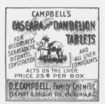
See Happy Smile Next Page Thousands of Boxes Sold Annually The Pictures Tell a True Story of the Work of the Little Pills