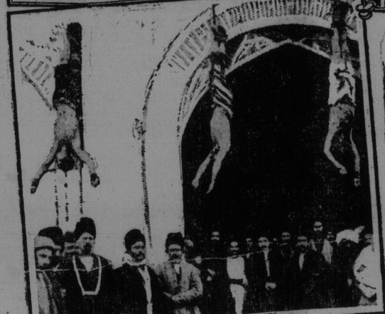
Above shows three bandits hanged by the heels at gates of Terenan. Upper picture shows mode of punishment for misdemeanors.

ity --- The Arguments He deavoing to si laid down the follow such co A series of been published in this connect less in my first letter and from their the Garden of creation and its specific properties. mes in my first letter and from their whole tenor, that I am not writing from an infidel standpoint. I admit the existence of a great Infinite Be-ng, perfect in every attribute; also he founder of Christianity and be-