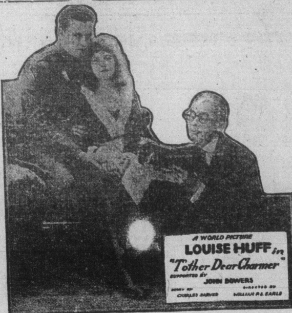
TITLE OF FIRST WORLD-PICTURE STARRING LOUISE HUFF IS "T'OTHER DEAR CHARMER"