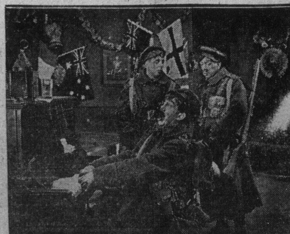
Scene showing the wonderful spirit of cheerfulness and "carry-over" of the British army, in that grandest of all cinemas, "The Better 'Ole" which comes to the Allen, Feb. 17, 18 and 19.