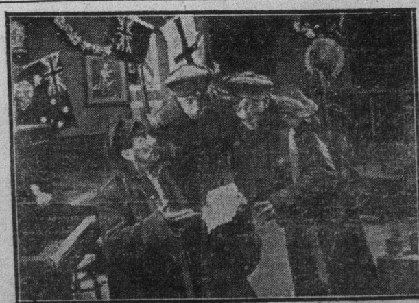
Bill, Bert and Alf, in a scene from "The Better 'Ole", at the Allen Theatre, Feb. 17, 18 and 19.