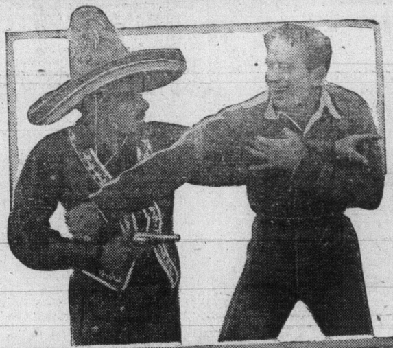
Douglas Fairbanks in "Arizona" at the Allen Wed. and Thurs.