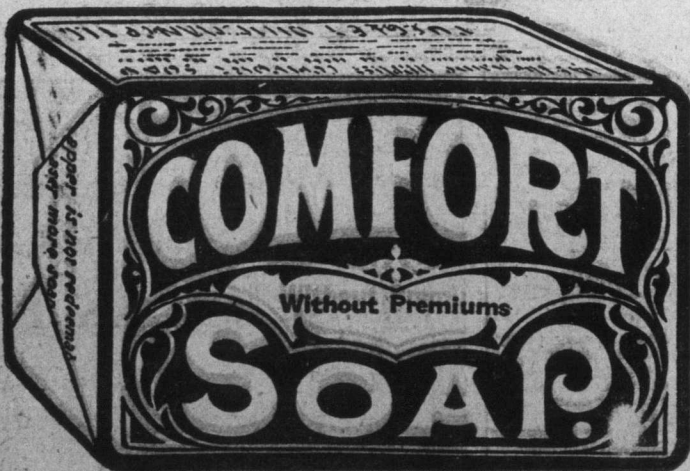
ACTUAL SIZE—the "Bigger Bar"

And science to-day knows of no way of making a better household soap.