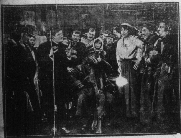
action of two continents, "The Better 'Ole", at the Allen theatre three days commencing Monday, Feb. 17th.