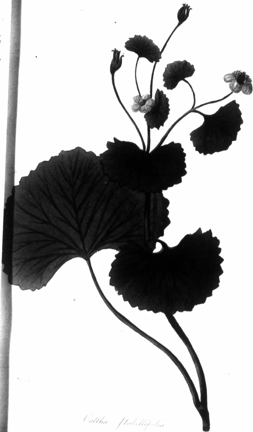
Caltha flabellifolia .