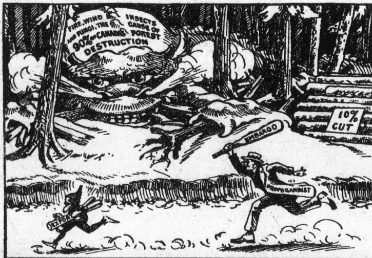
Why waste time on the harmless little fellow when a big danger threatens Canada's forest wealth?