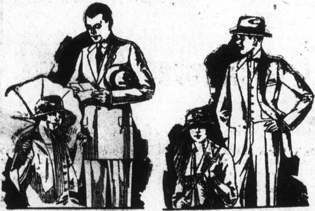
THE WATFORD DRY GOODS COMPANY, Limited