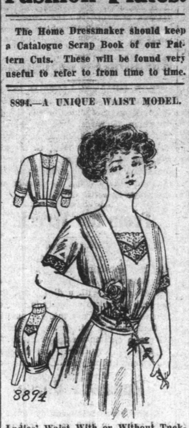
Ladies' Waist With or Without Tuck.