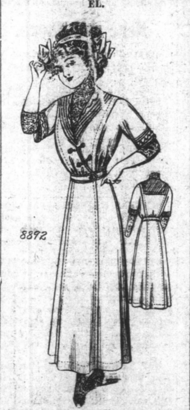
One Piece Dress for Misses and Small Women.