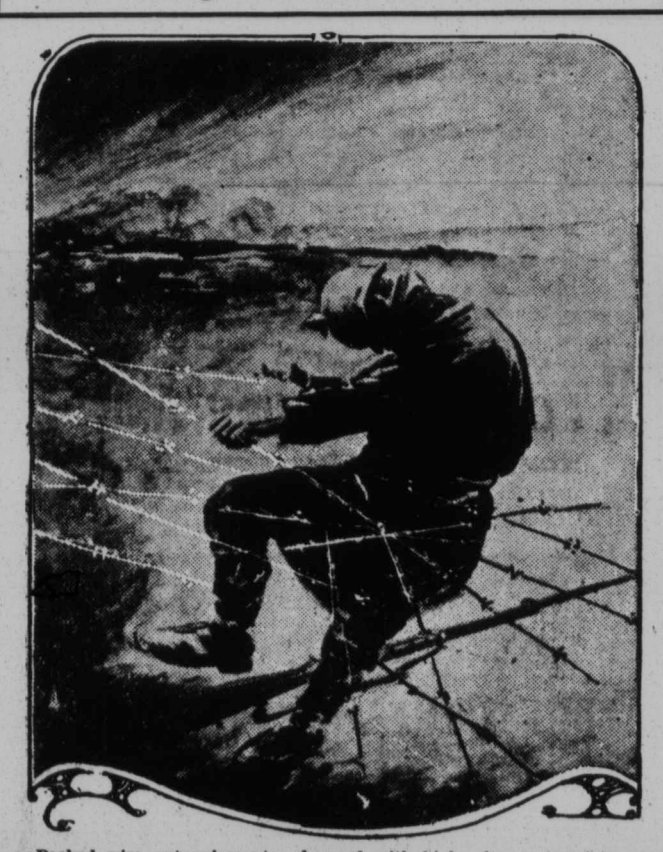
d by both sides in the war fronts. The picture shows a German soldier

Death Charge Into Electrified Barb Wires