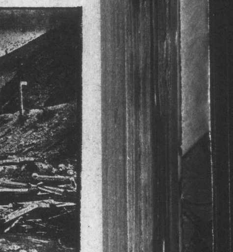
SPENCE'S BRIDGE LANDSLIDE. Foot of the Indian Church Which Was Swept by Water a Distance of 800 Feet.

Work on the high tension pole line of the West Coast Power & Light Company is making good progress. The pole lines are up from here to Rock Creek, and from there to Silica.