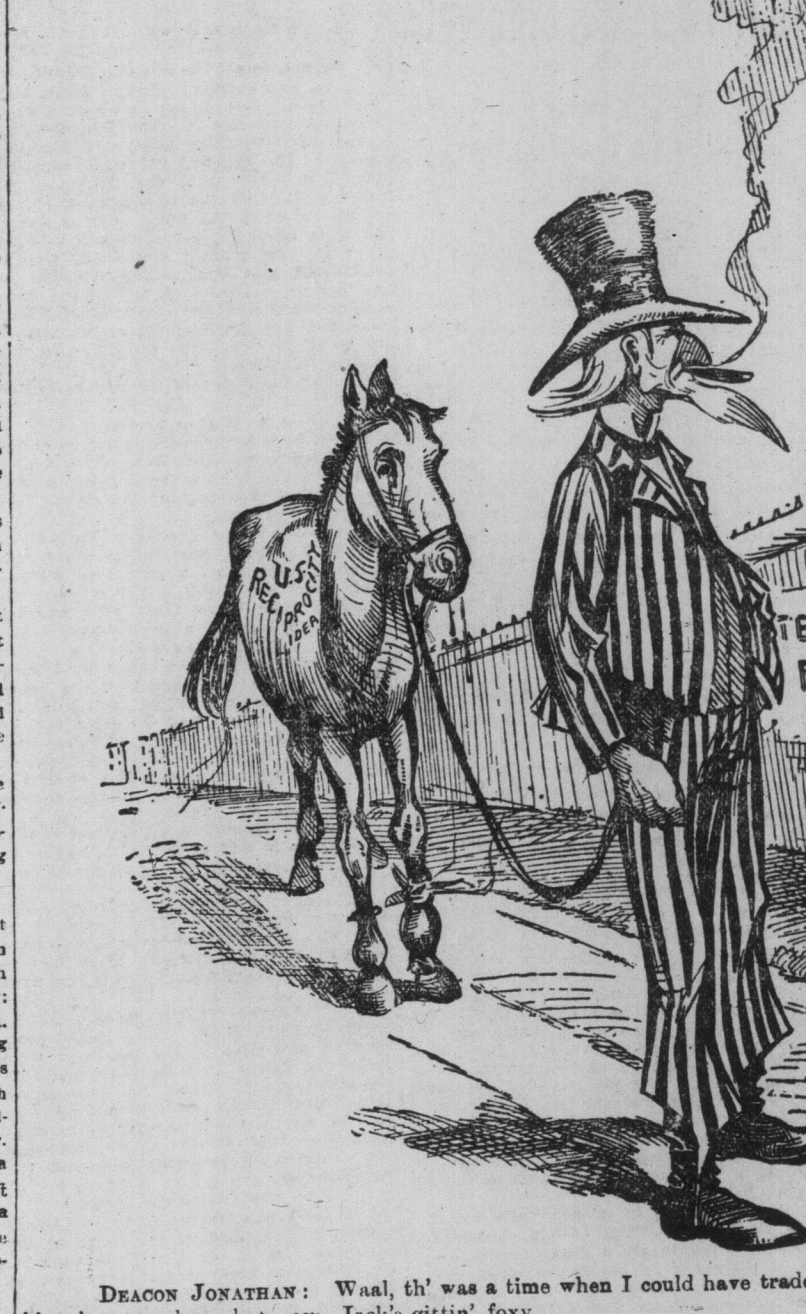
DEACON JONATHAN: 'Waal, th' was a time when I could have traded this old "skate" to Jack Canuck for a big advantage hoss, but say—Jack's gittin' foxey.