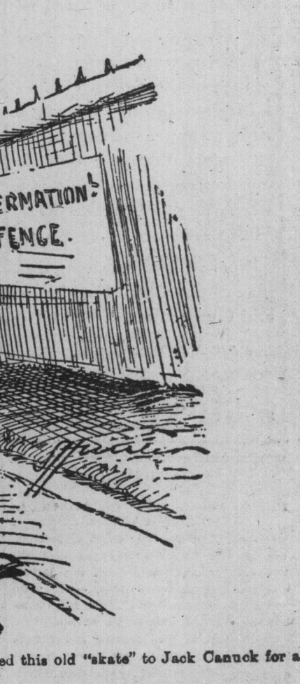
DEACON JONATHAN: 'Waal, th' was a time when I could have traded this old "skate" to Jack Canuck for a big advantage hoss, but say—Jack's gittin' foxey.

Obtained in all countries by CHARLES H. ROBERTS, Patent Attorney, 202, 204, 206, 208, 210, 212, 214, 216, 218, 220, 222, 224, 226, 228, 230, 232, 234, 236, 238, 240, 242, 244, 246, 248, 250, 252, 254, 256, 258, 260, 262, 264, 266, 268, 270, 272, 274, 276, 278, 280, 282, 284, 286, 288, 290, 292, 294, 296, 298, 300, 302, 304, 306, 308, 310, 312, 314, 316, 318, 320, 322, 324, 326, 328, 330, 332, 334, 336, 338, 340, 342, 344, 346, 348, 350, 352, 354, 356, 358, 360, 362, 364, 366, 368, 370, 372, 374, 376, 378, 380, 382, 384, 386, 388, 390, 392, 394, 396, 398, 400, 402, 404, 406, 408, 410, 412, 414, 416, 418, 420, 422, 424, 426, 428, 430, 432, 434, 436, 438, 440, 442, 444, 446, 448, 450, 452, 454, 456, 458, 460, 462, 464, 466, 468, 470, 472, 474, 476, 478, 480, 482, 484, 486, 488, 490, 492, 494, 496, 498, 500, 502, 504, 506, 508, 510, 512, 514, 516, 518, 520, 522, 524, 526, 528, 530, 532, 534, 536, 538, 540, 542, 544, 546, 548, 550, 552, 554, 556, 558, 560, 562, 564, 566, 568, 570, 572, 574, 576, 578, 580, 582, 584, 586, 588, 590, 592, 594, 596, 598, 600.