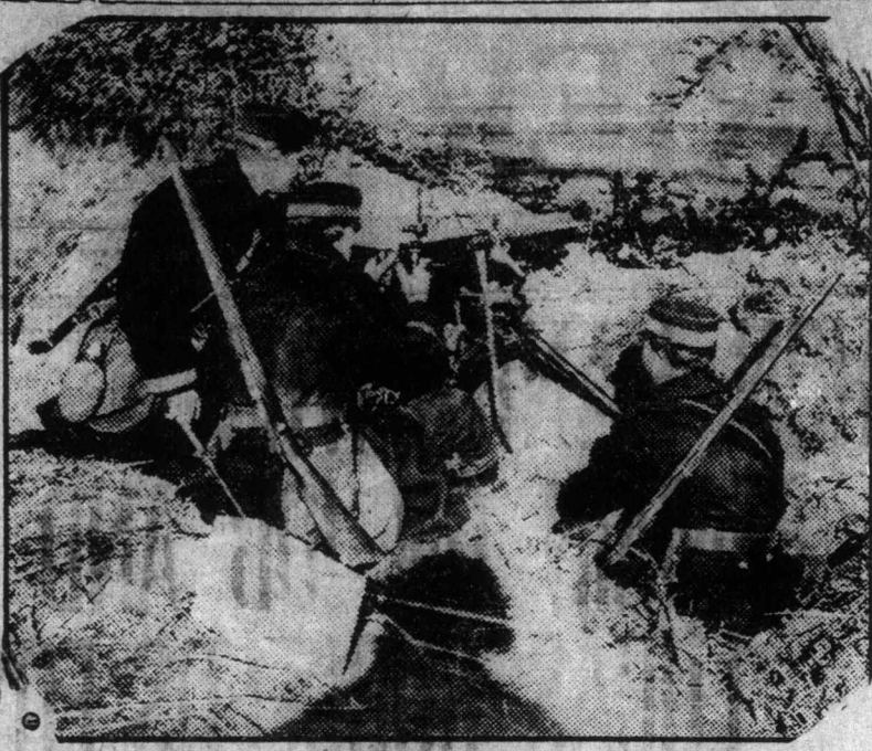
BELGIAN MACHINE GUN IN ACTION-ACTUAL SCENE IN THE GREAT WAR PICTURES AT THE GRAND, FRIDAY AND SATURDAY, DEC. 25 AND 26. MATINEE DAILY.