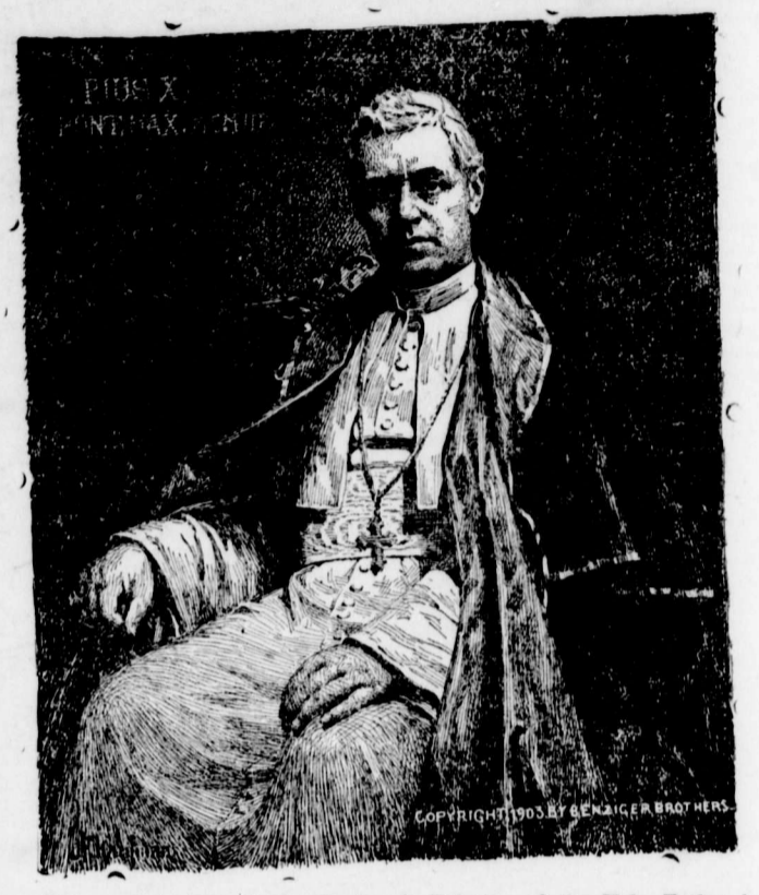
This reproduction of Mr. Kaufman's Painting of the Holy Father is an exact likeness, reproduced by a new and surprisingly effective process, which preserves all the values of the original oil painting. It will be an ornament to every Catholic home.

TORONTO. Toronto, Jan. 21. - Wheat - The market is steady; No. 2 white and red winter quoted at 90c; No. 1 white and red winter, 85c; No. 3 white and red winter, 80c; No. 4 white and red winter, 75c; No. 5 white and red winter, 70c; No. 6 white and red winter, 65c; No. 7 white and red winter, 60c; No. 8 white and red winter, 55c; No. 9 white and red winter, 50c; No. 10 white and red winter, 45c; No. 11 white and red winter, 40c; No. 12 white and red winter, 35c; No. 13 white and red winter, 30c; No. 14 white and red winter, 25c; No. 15 white and red winter, 20c; No. 16 white and red winter, 15c; No. 17 white and red winter, 10c; No. 18 white and red winter, 5c; No. 19 white and red winter, 0c; No. 20 white and red winter, 0c.