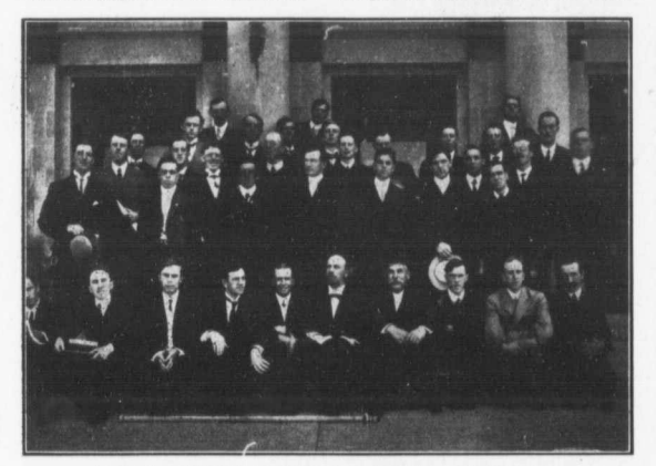
A GROUP OF SASKATCHEWAN CONFERENCE PROBATIONERS. President of Conference in centre, Superintendent of Missions at his left.

Jesus takes up the challenge. He tells the parable, and he also makes a posi-