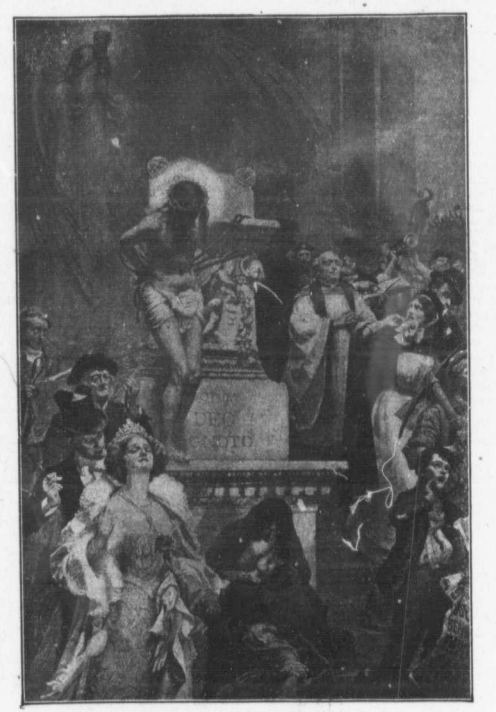
"DESPISED AND REJECTED OF MEN."

hour. The good seed had certainly fallen non. The good seed had certainly falled on unfruitful soil. Stung with disap-pointment, he resolved to give expres-sion to his feelings upon canvas. The result is the masterpice, "Despised and Rejected of Men."