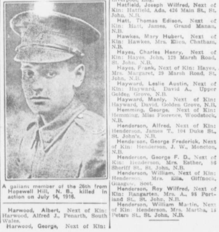
A galiant member of the 26th from Hopewell Hill, N. B., killed in action on July 14, 1916.