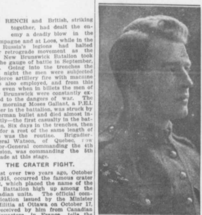
Now second in command of a forestry unit, mentioned in despatches while serving as a private in the 26th during the winter of 1915-16.