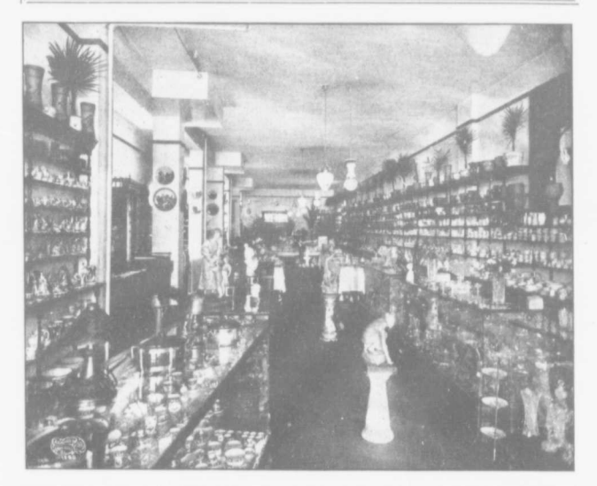
INTERIOR VIEW OF OUR NEW STORE

Our special offer to brides means a saving on your china and glass. Don't fail to ask us about it.