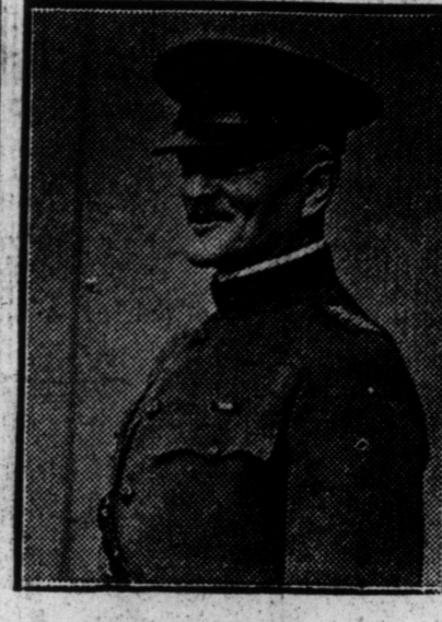
GEN. JOHN PERSHING.

UPTOWN h 17, 18, 19. ANKS IN "THE NUT" EVILLE, ACTS - 6 Alice Brady