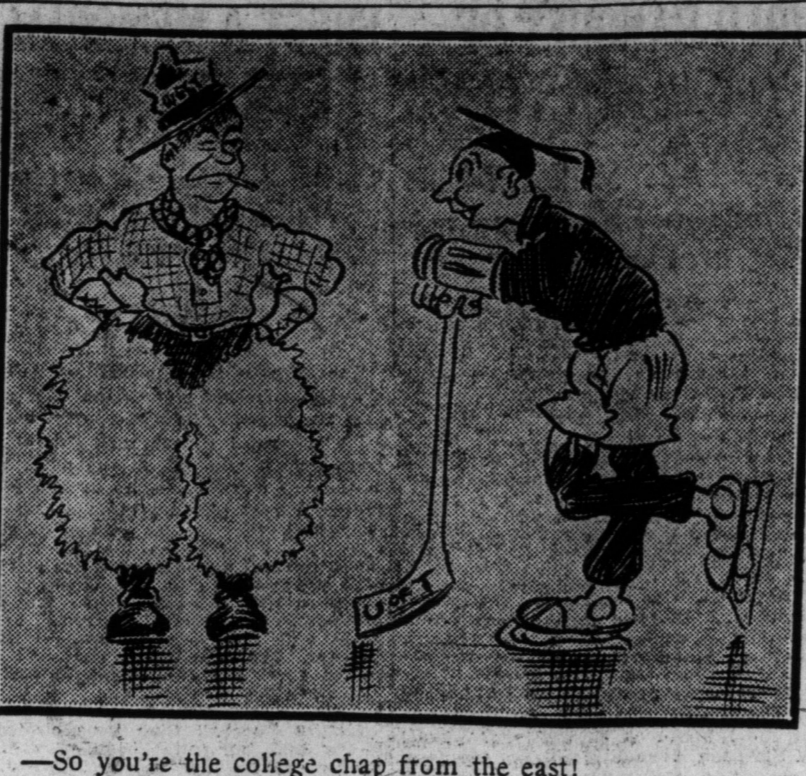
—So you're the college chap from the east! —And you're the western chap that I'm out here to teach!