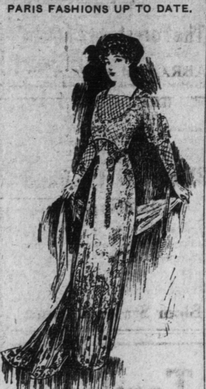
PARIS FASHIONS UP TO DATE. Pink satin gown, with tunic of taupe embroidered chiffon; belt trimming of burgin, with lattice work of same, in violet and black.

HALF A MILLION CASH DEPOSIT MADE BY C.N.R. With B. C. Government in Part Security For Carrying Out of the Company's Agreement. VICTORIA, B. C., March 1.—(Special.)—The bills to ratify the agreements between the government and the Canadian Northern and Kettle River Valley Railway companies, and to provide for construction and operation of their lines, the first mentioned thru British Columbia, from the eastern boundary at Yellowhead Pass, to an ultimate terminus on Barkeley Sound, Vancouver Island, fully redeem all promises given by Premier McBride.